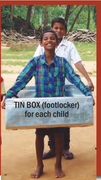
TIN BOX (footlocker) for each child