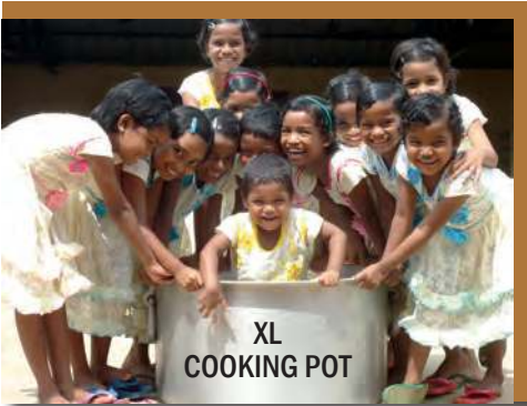
XL COOKING POT